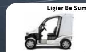
Ligier Be Sum