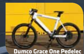
Dumco Grace One Pedelec